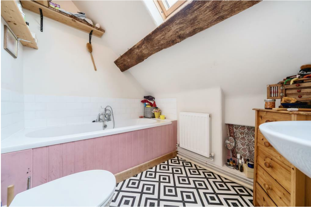
17 of 23Photos