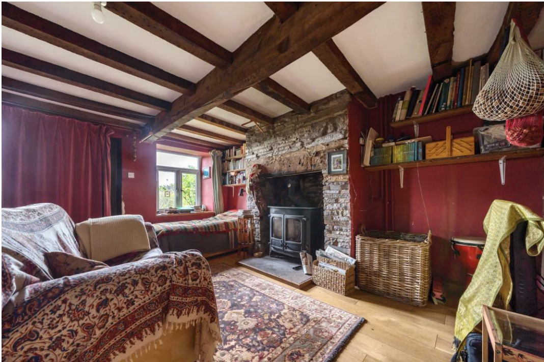
10 of 23Photos (16)