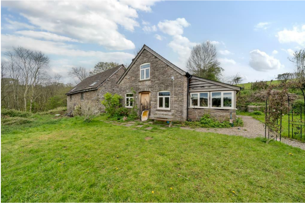
3 of 23 Front Aspect