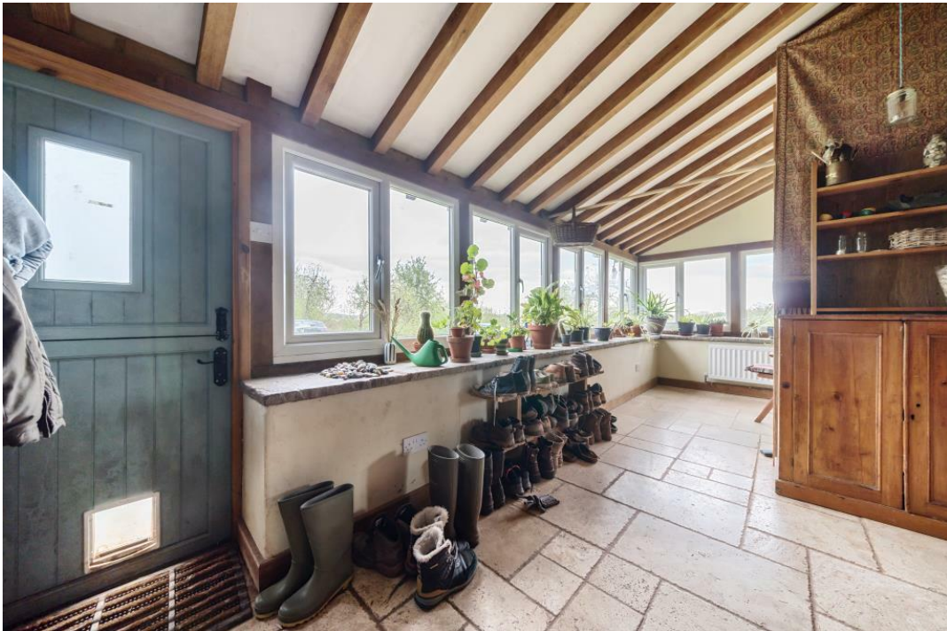
4 of 23 Photos (19)