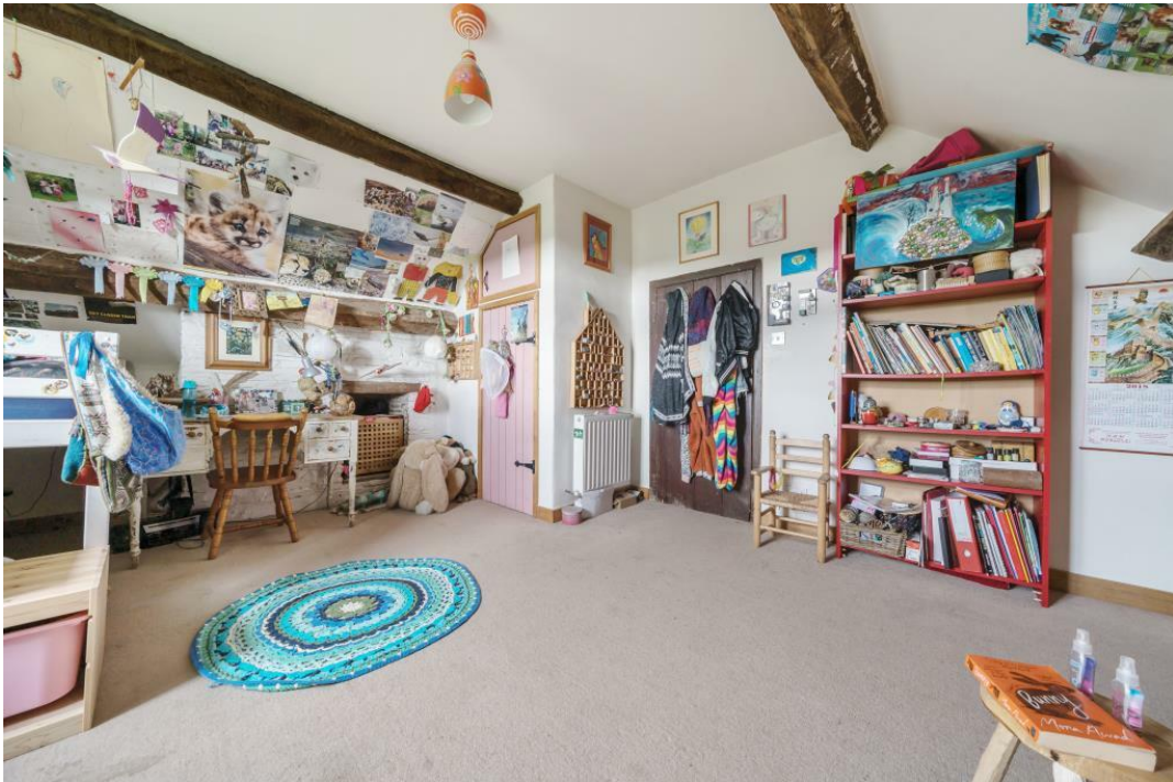
16 of 23Photos