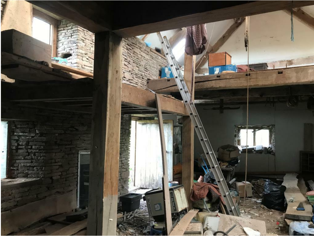
21 of 23Photo