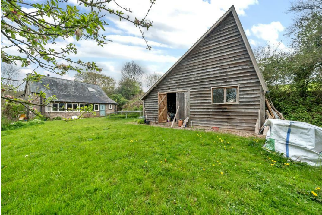
19 of 23Photos