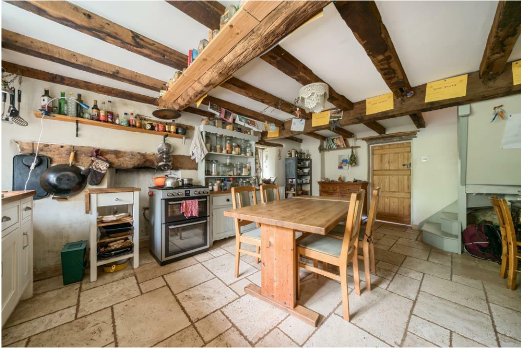
7 of 23Photos (14)