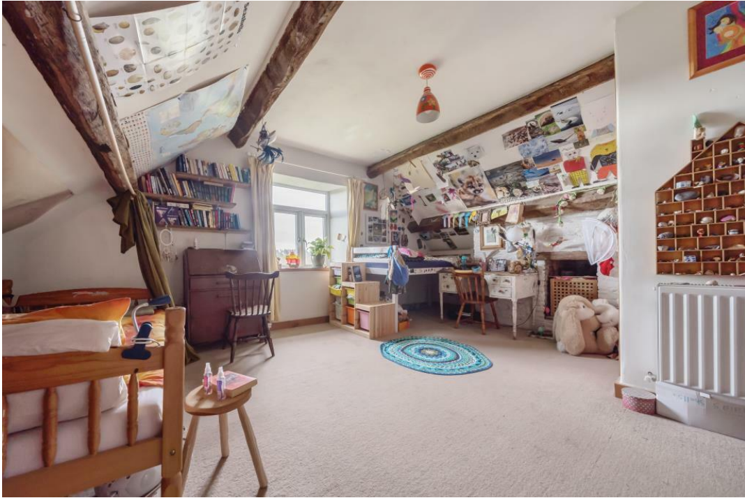
13 of 23Photos