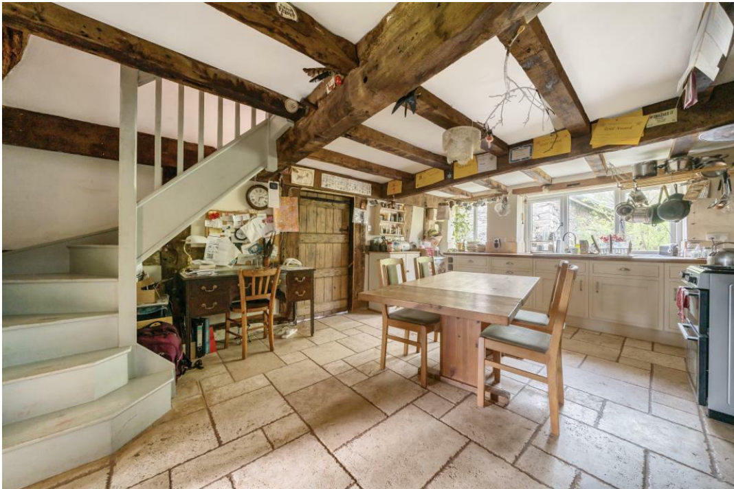
8 of 23Photos (12)