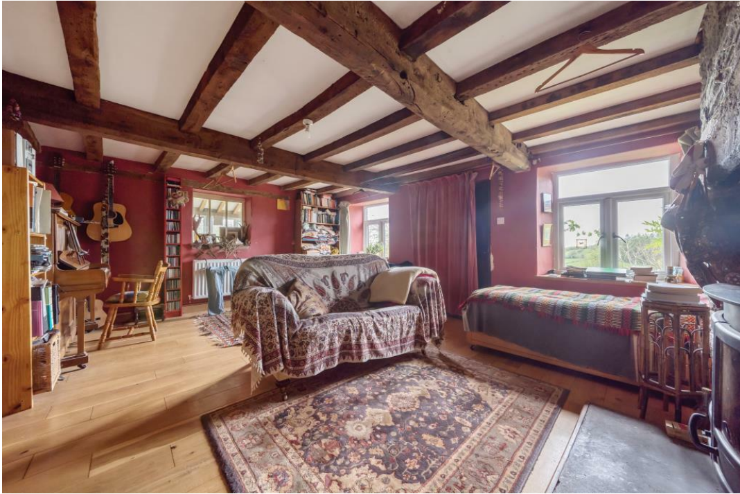
9 of 23Photos