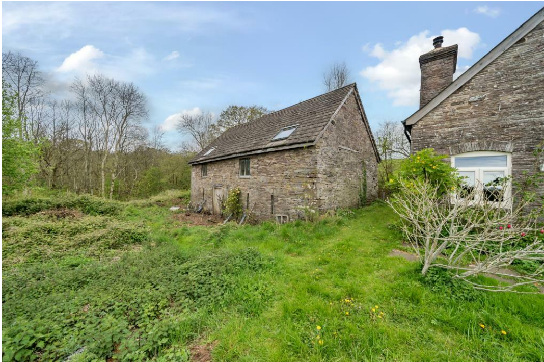
18 of 23Photos