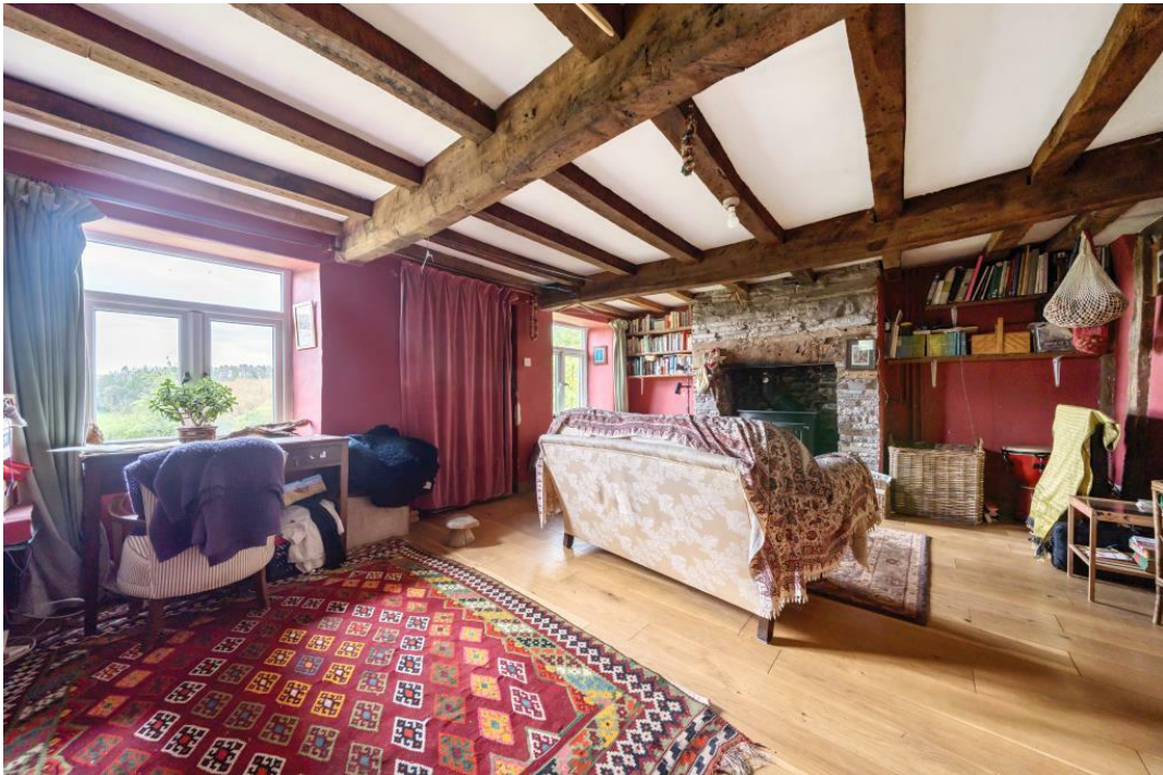
12 of 23Photos