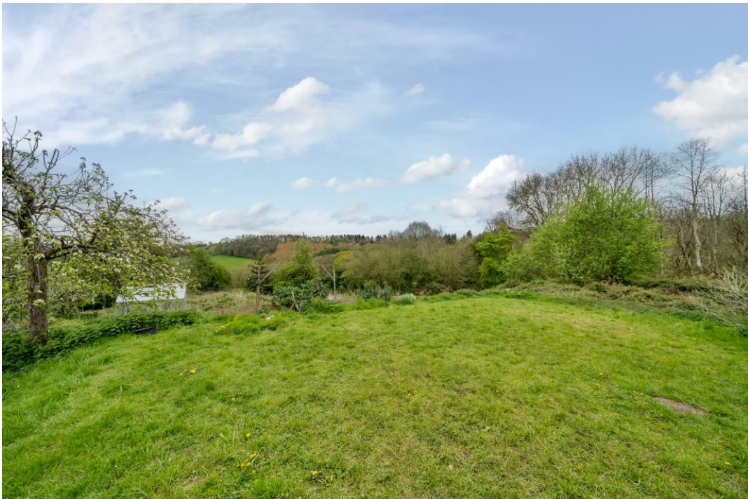
2 of 23 Photo