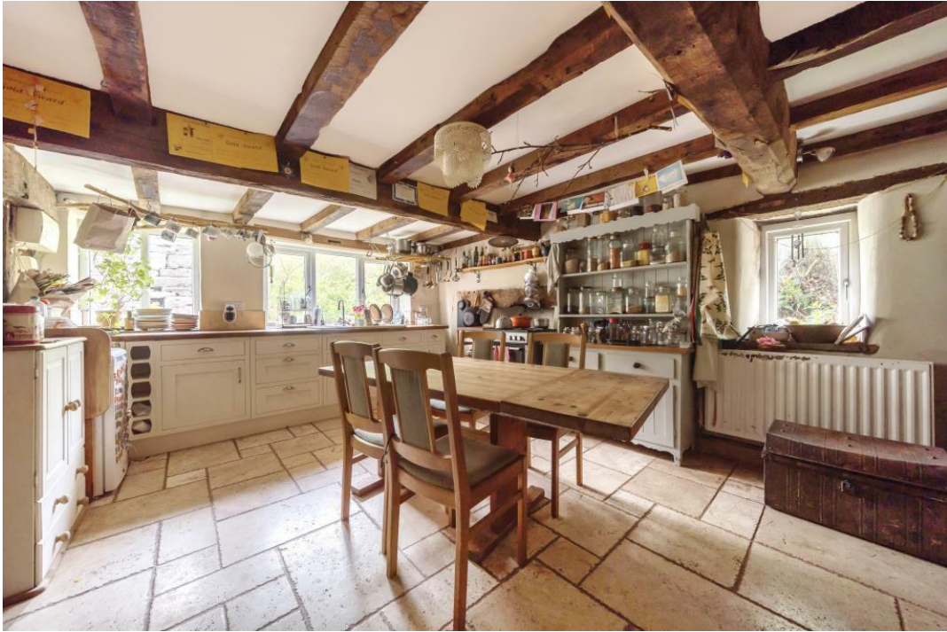
5 of 23Photos