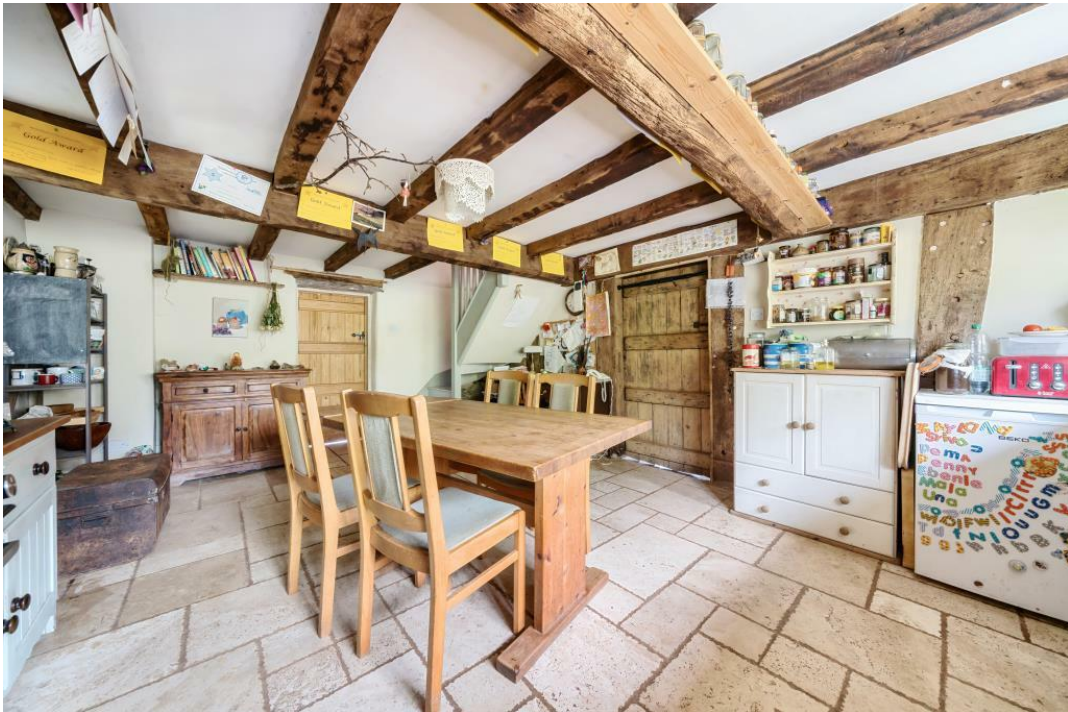
6 of 23Photos (12)