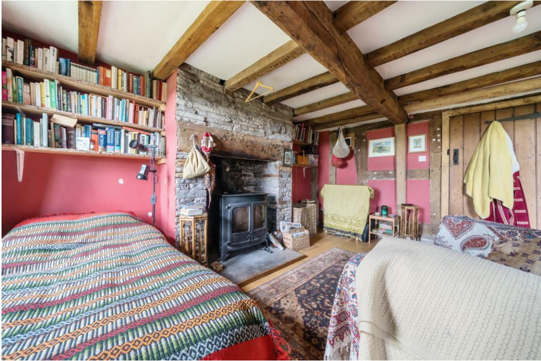
11 of 23Photos