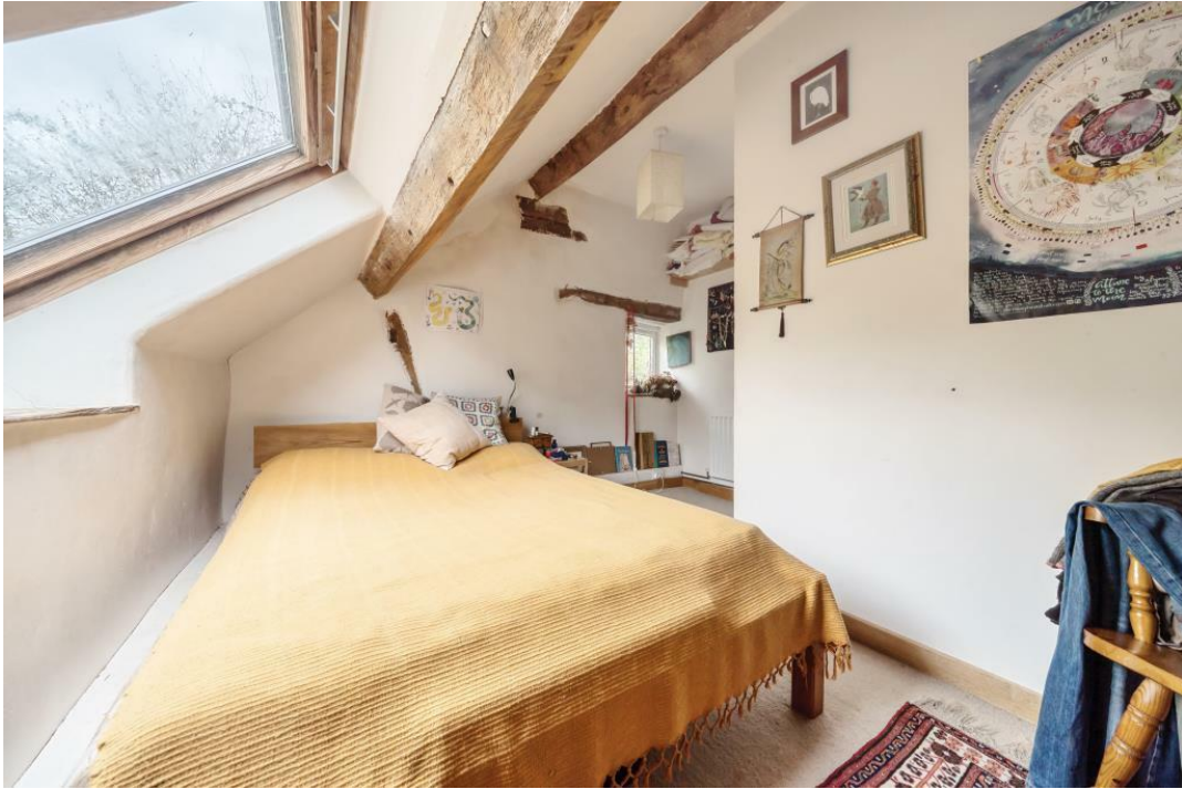
15 of 23Photos