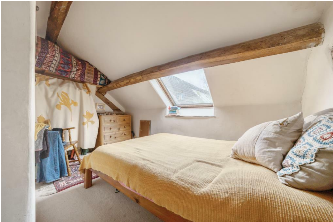
14 of 23Photos