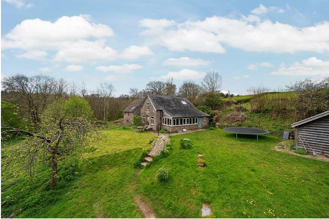
1 of 23 Elevated Photos