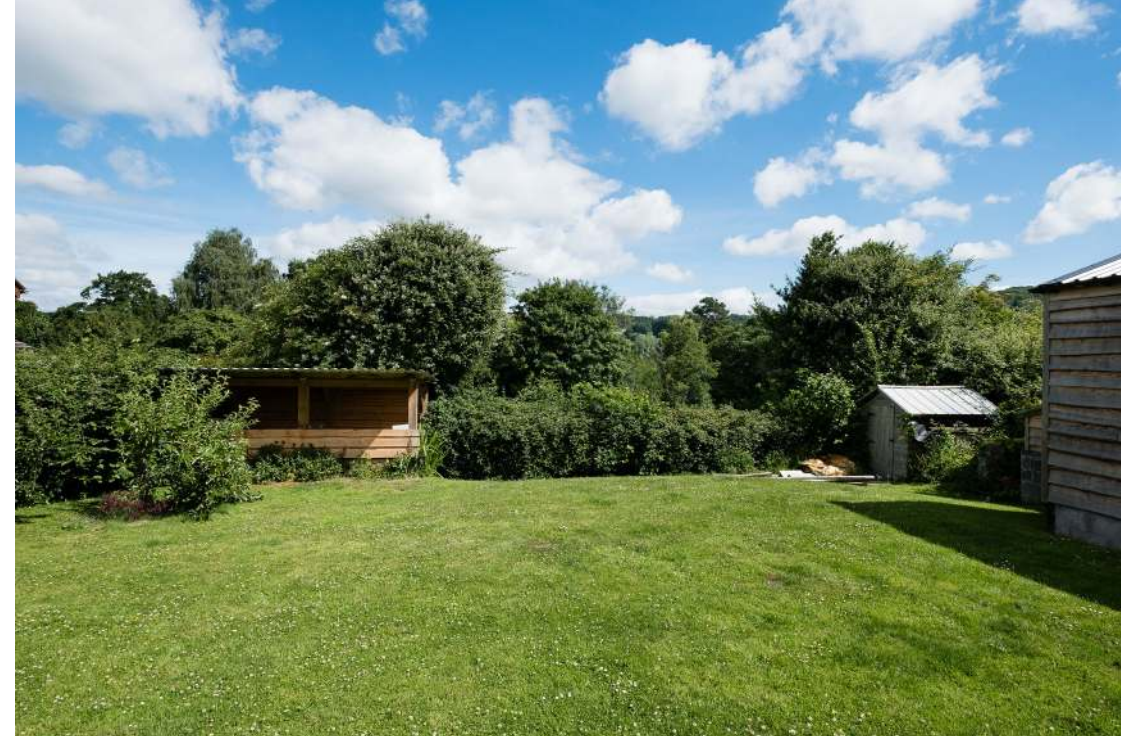
Set in the very pretty village of Dorstone