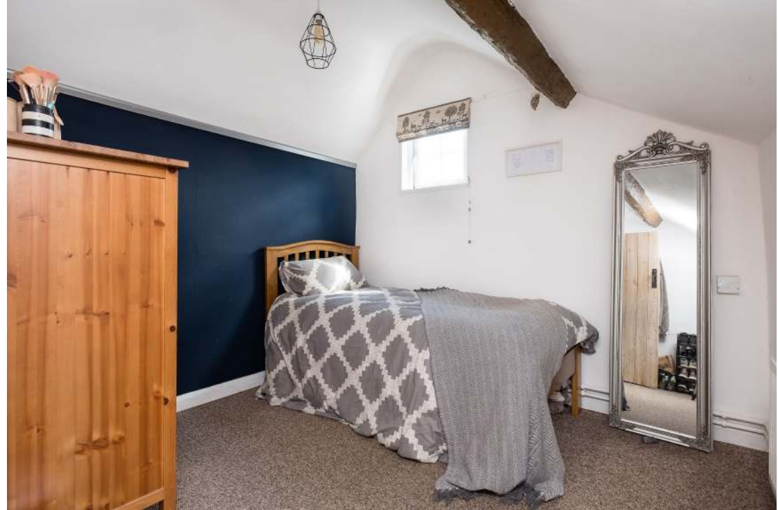
Two comfortable bedrooms with cot room off with g/f shower room and utility room below