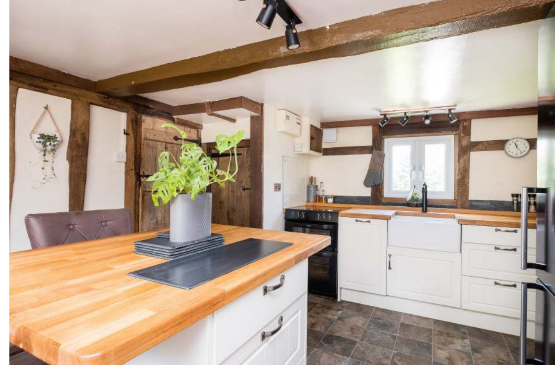
A delightful cottage, well presented and maintained and oozing character and charm