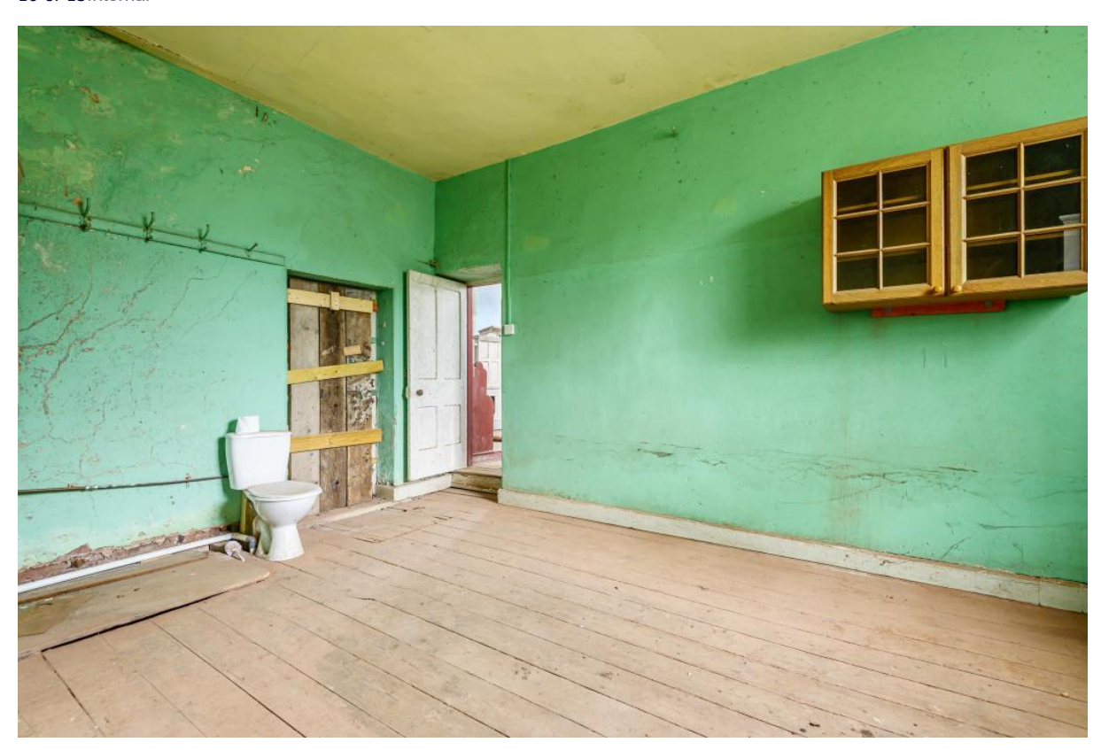
11 of 15Internal