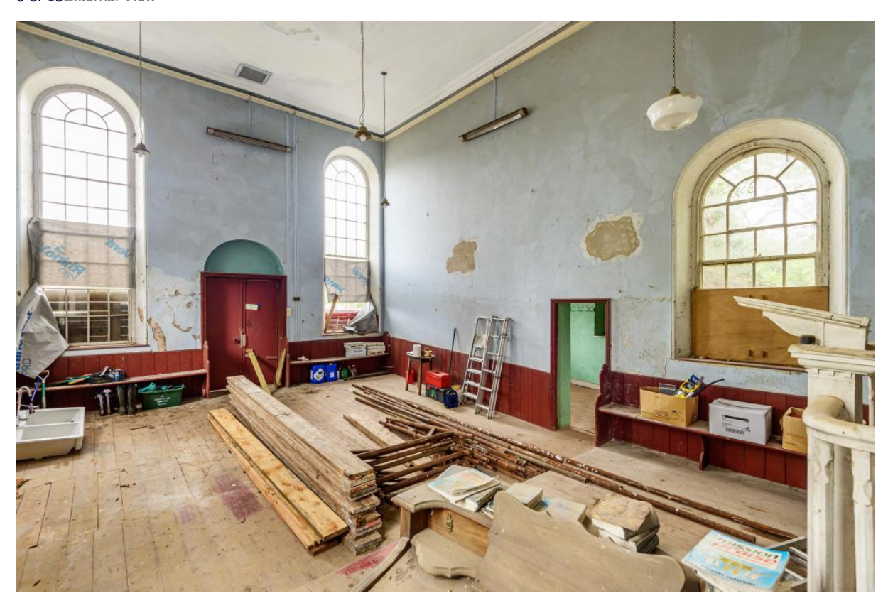
7 of 15Internal