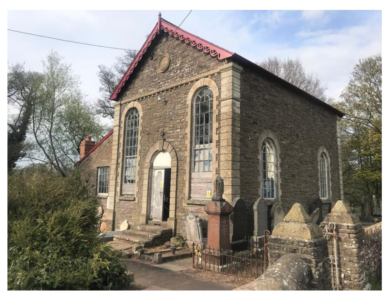
14 of 15Main Aspect