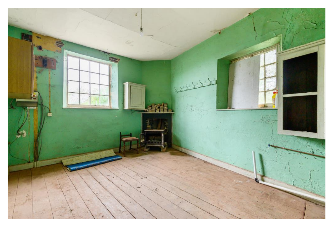
10 of 15Internal