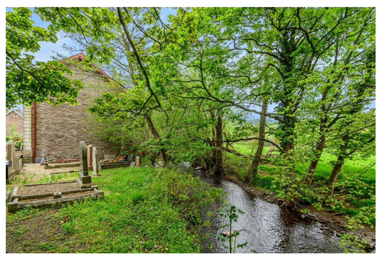
5 of 15External View