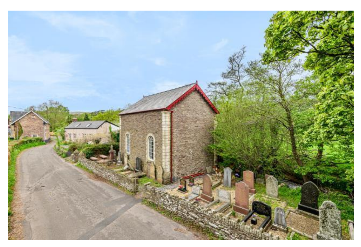
12 of 15Elevated Photos