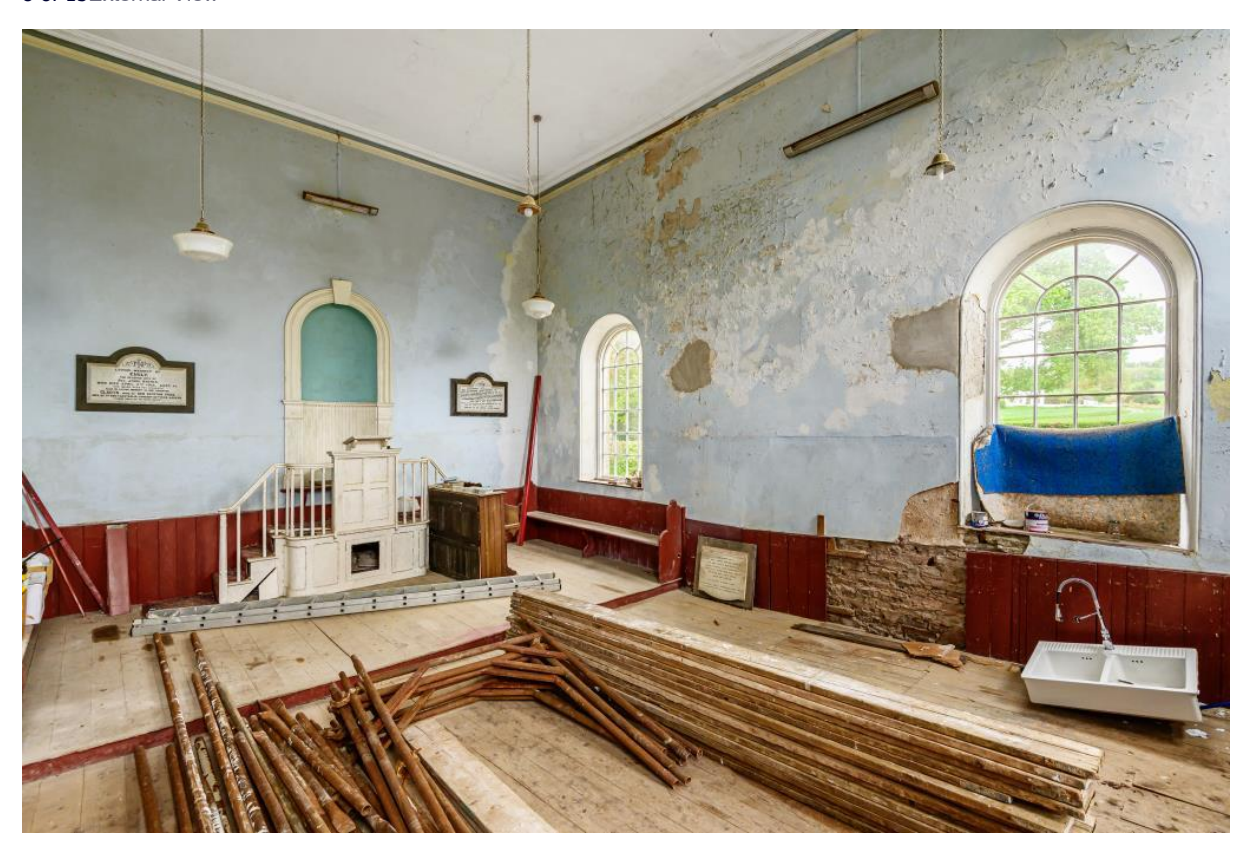
9 of 15Internal