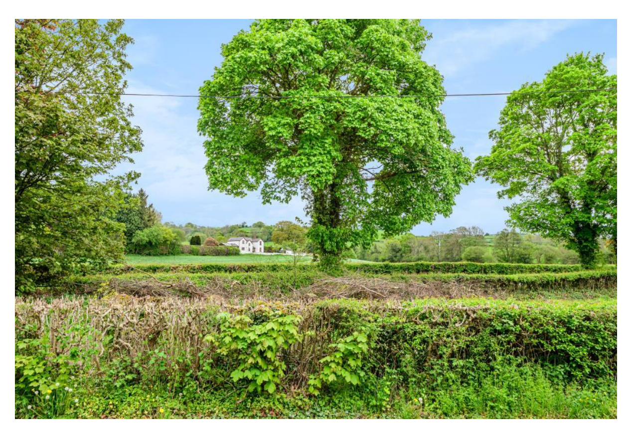
6 of 15External View