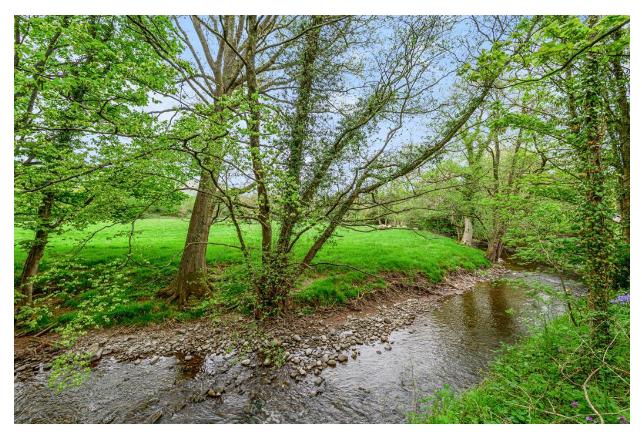
8 of 15External View