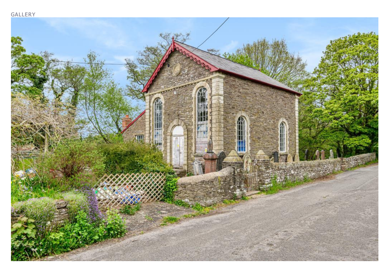
1 of 15Front Aspect

An ornate Chapel with planning permission to create a two bed holiday cottage with views over the River Honddu and surrounding countryside. Also has a application pending for change of use to residential.