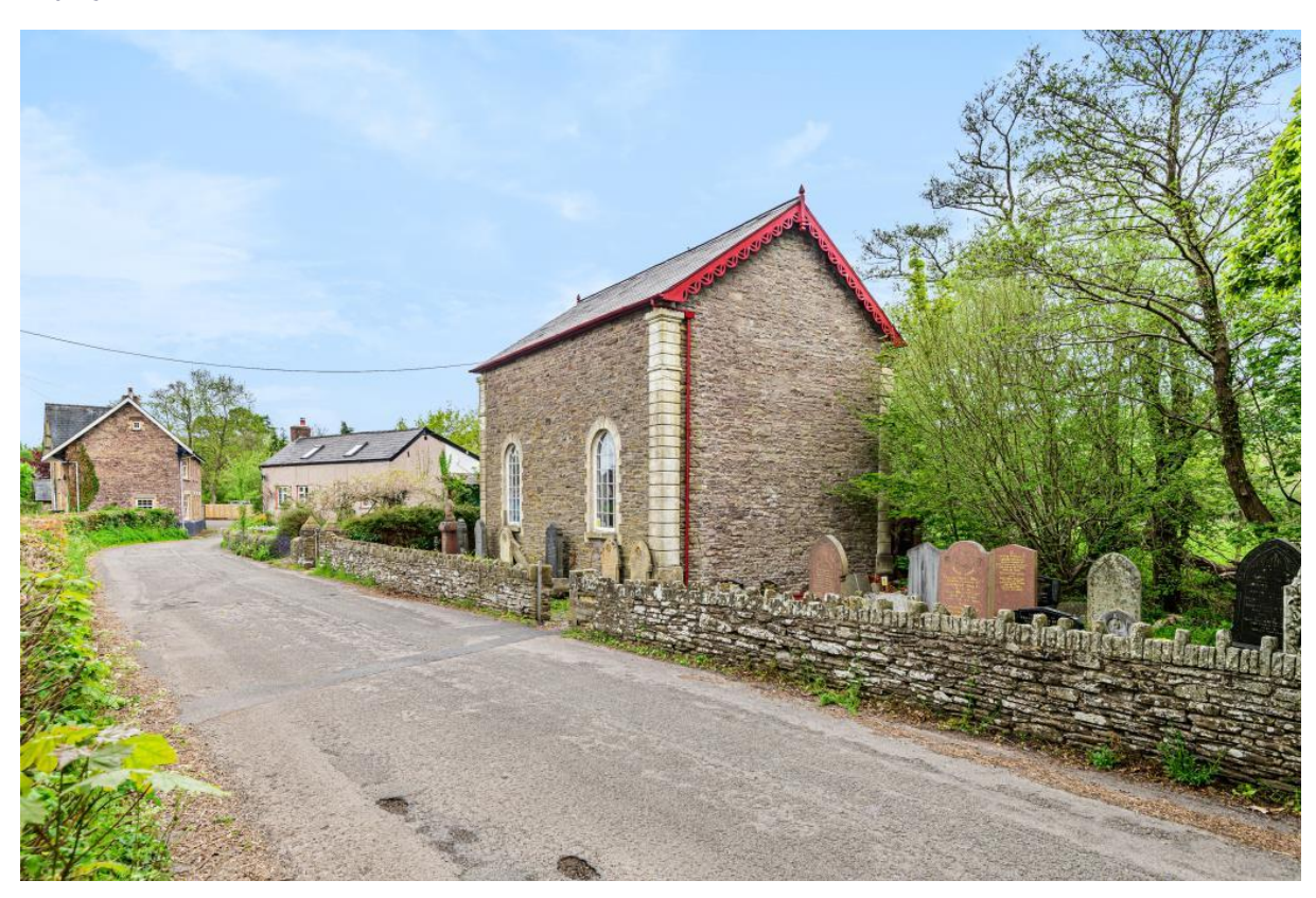
13 of 15External View