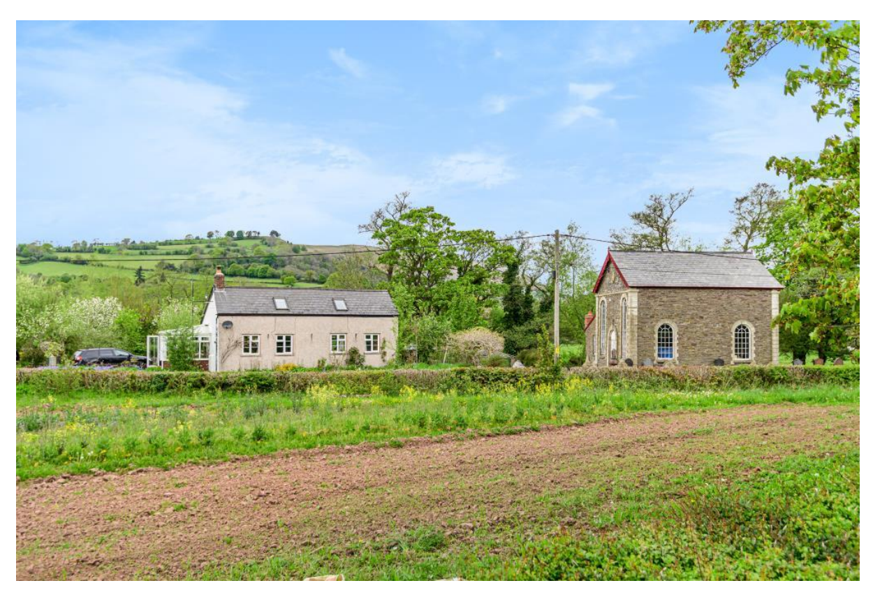
4 of 15External View