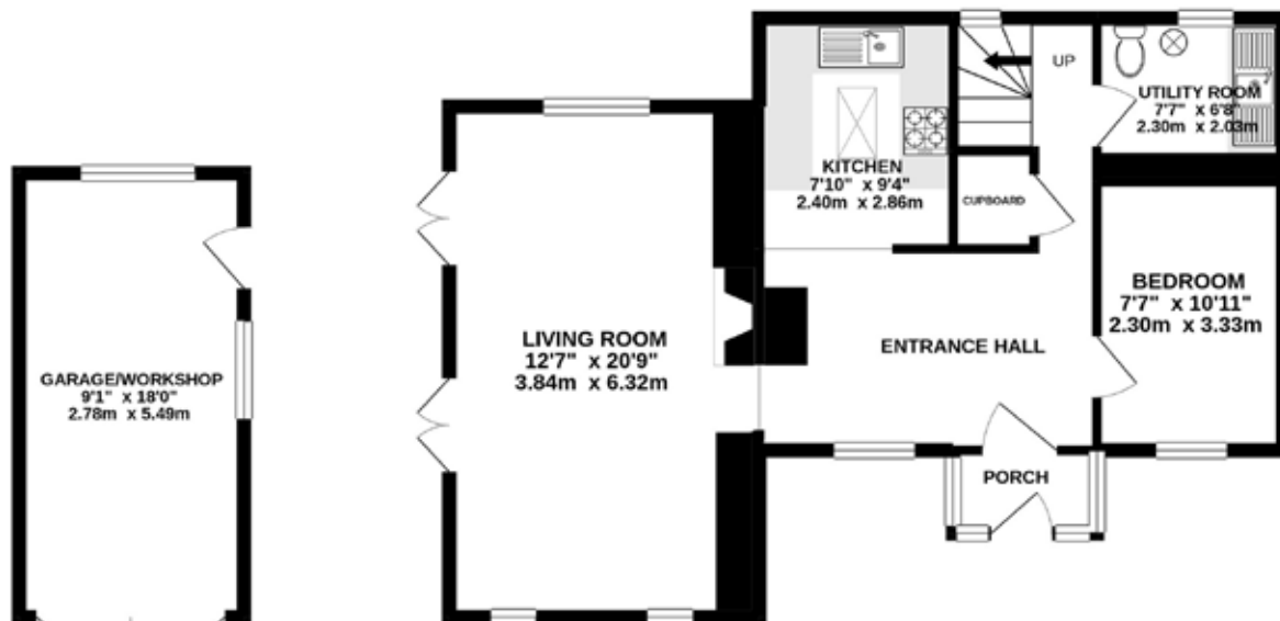
GROUND FLOOR 778 sq.ft. (72.2 sq.m.) approx.